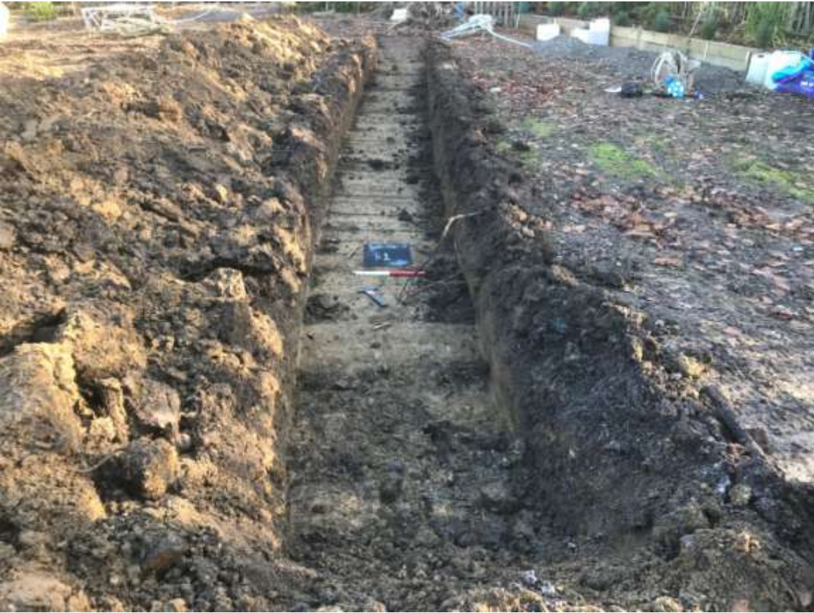
Plate 2. Trench 2 (looking SE)