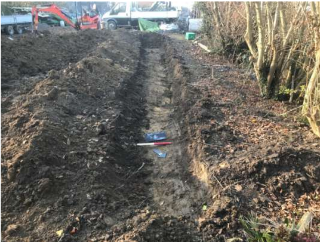
Plate 1. Trench 1 (looking north)