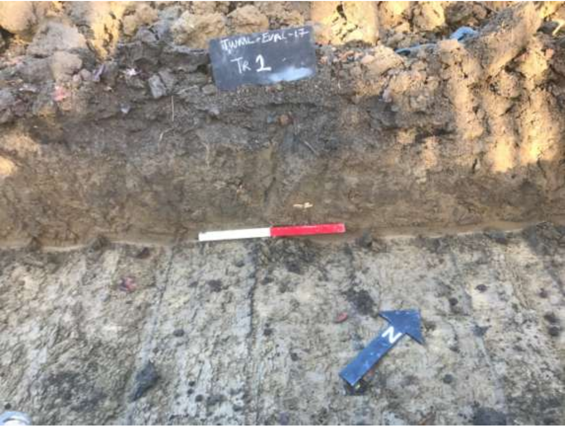
Plate 3. Trench 2 (section)