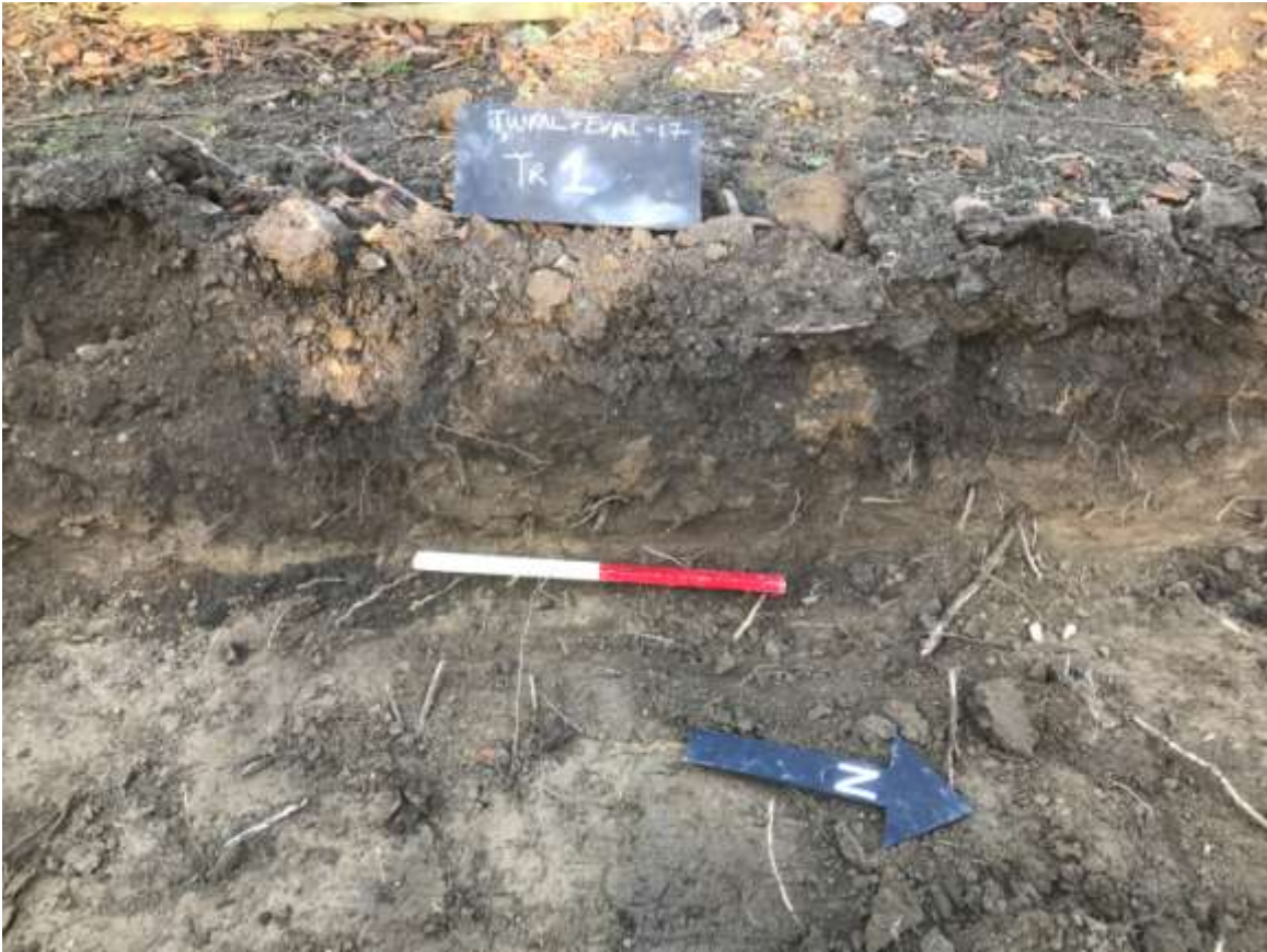
Plate 4. Trench 1 (section)